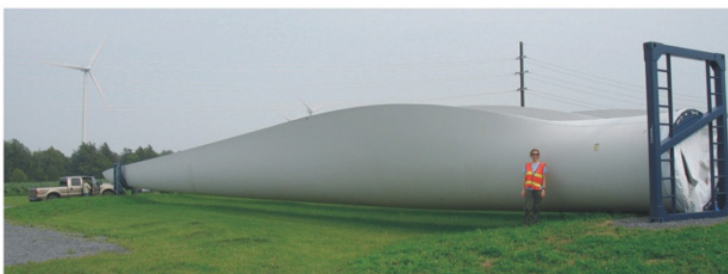
Blade of the wind turbine