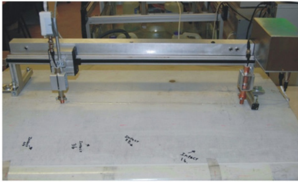
Inspection of the segment of the wind turbine blade