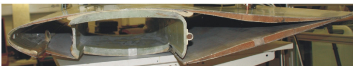
Complex structure of the wind turbine blade